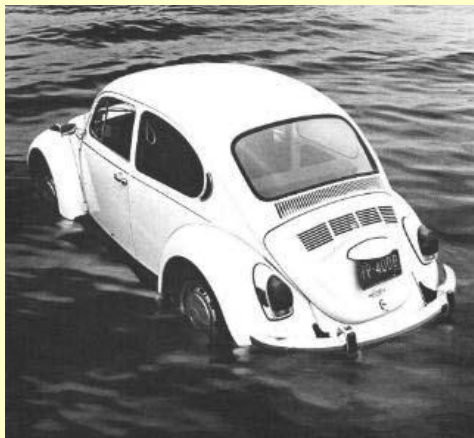
Bob's Floating VW Bug

Check out Bob on You-Tube: http://www.youtube.com/watch?v=6tX0lbrUGzE Keep your doors closed!